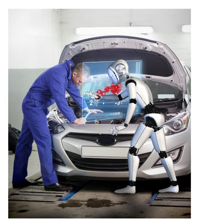
Abb. 1: In "co-botting", people and machines mutually support one another.

It is interesting to note that there is another core question regarding digitization which has been addressed very little: How can people and machines mutually support one another using digital processes in such a way that creates a high-performance work cycle? This system may be known as "co-botting", but "digitally assisted working" is a more meaningful expression.